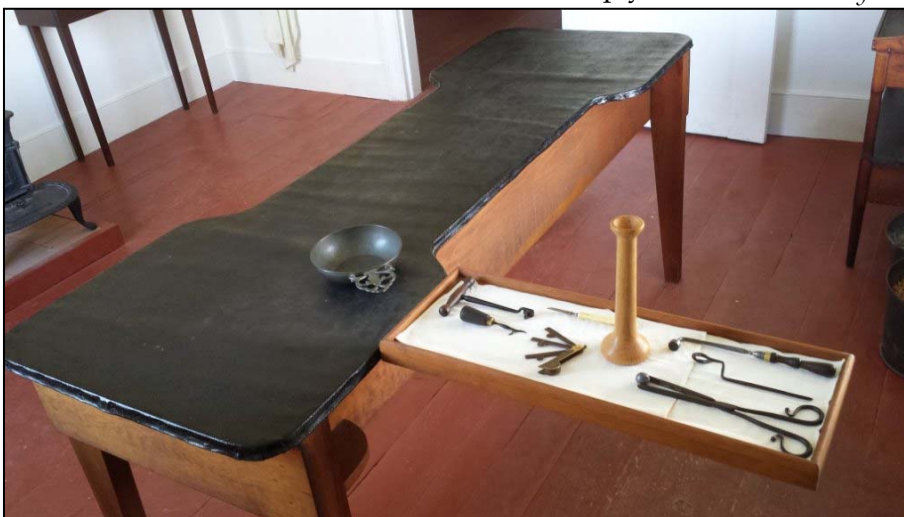
Photo above and at top right: Reproduction surgeon's table and medical equipment (c. 1836).