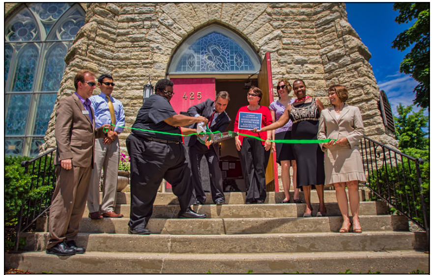
At the Divine Temple Church of God in Christ (formerly Christ Episcopal Church) complex, Green Bay Mayor Jim Schmitt cuts the ribbon to mark the Church being registered on the National Register of Historic Places. (June 28, 2013).